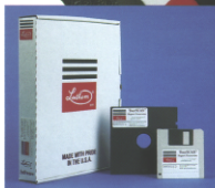
Produce customized, more informative reports, using TourSCAN Report Generator Software (GT1000).

TourSCAN, although a new technology, comes with a background of experience. Manufactured by the Lathem Time Corporation, TourSCAN comes from an American company that's been in the business since 1919. A company well-known for its dependable, prompt and courteous service.