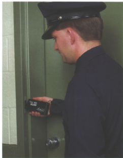
Station labels are easily secured in hidden locations.

Incidents booklet contains 50 user definable bar coded incidents.